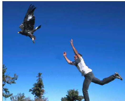
"Wait for me!"