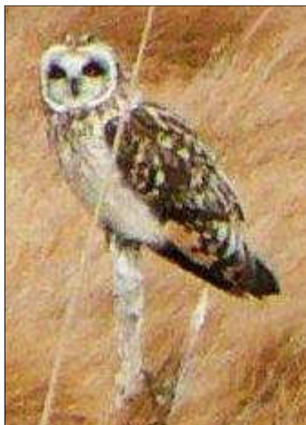
Above: Short-eared Owl; Top Right: Long-tailed Duck; Below Right: Harlequin Ducks.