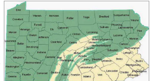
The Marcellus Shale rock formation underlies approximately 67% of Pa (shaded), at a depth of 5,000-8,000 feet. It is believed to hold trillions of cubic feet of natural gas. From: Marcellus Shale Industry Snapshot Update; Executive Summary. 20100331 Marcellus Shale PA Statewide.pdf.